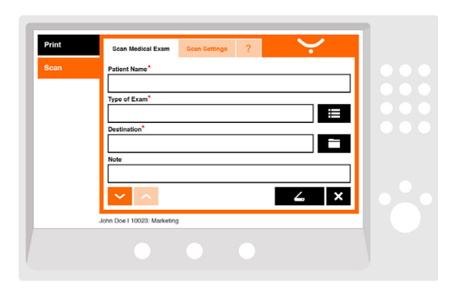
Figure 2. Sample single scan menu.

Delivery on behalf of user who scanned document